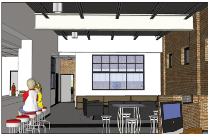
Drawing of future snack bar, meeting area and computer center .

All of our youth programs are designed to offer at-risk young people a safe place to meet and a caring staff who can help and encourage them to make wise life choices that will equip them to succeed in school, avoid the addictions that will destroy their lives, and plan for a purposeful and productive future.